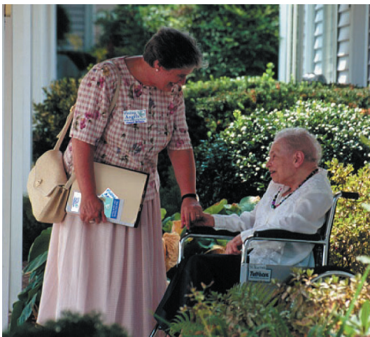
Making the home safer makes your life easier!